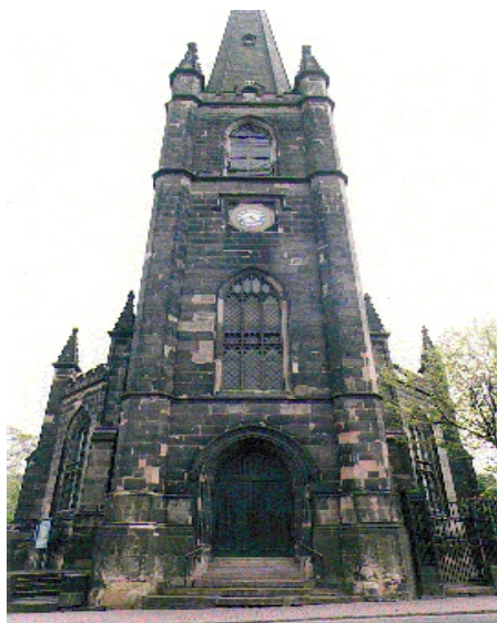
St Thomas Church Dudley