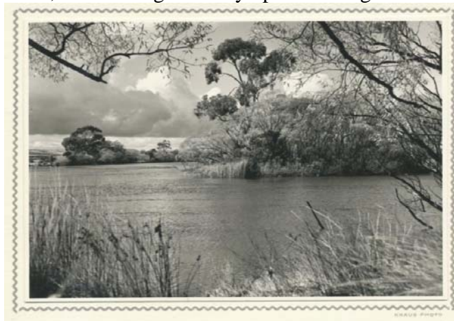
South Esk River near Longford