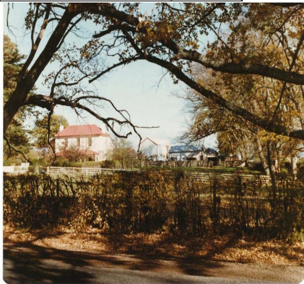
Land Grants, Longford district.